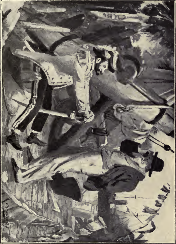
“THE DON SEATED HIMSELF ON THE STUMP OF THE BROKEN MAINMAST”